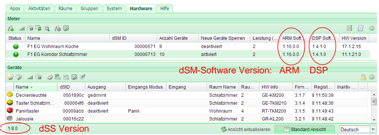
Fig. 1: Version number for dSS and dSM

The currently installed software version can be found within the digitalSTROM Configurator.